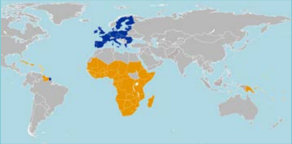
Figure 1. The EU (in blue) and the African, Caribbean & Pacific (ACP) Group of States (in yellow)